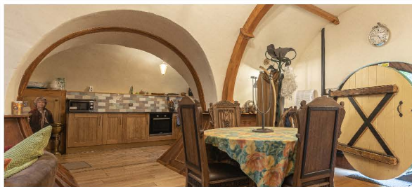
Pod Hollow Internal View

Local amenities include the Anglo-Saxon Village, Lackford Lakes, Larkwood Fisheries, King's Forest (for walking, cycling and horse-riding) and High Lodge cycle hire.